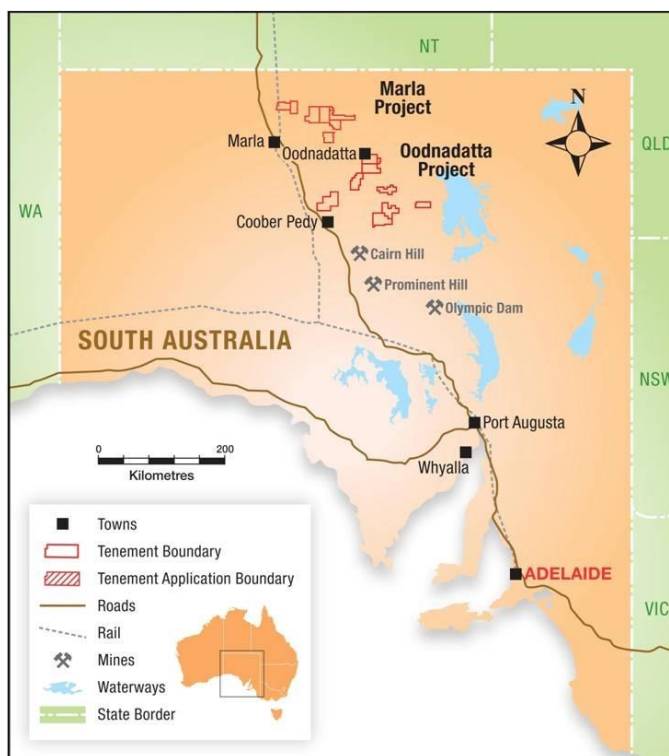
Figure 1 – Project Location Map

Work during the quarter has focussed on completing analysis of the drill program, with selected intervals being cut and sampled. A total of 175 half core samples (MS0001 – MS0175) were sent to Intertek Genalysis (Adelaide) for multi-element analysis by 4A/OM20, (four acid digest with a 60 element ICP-OES or ICP-MS scan) and 50g Fire Assay for Au, Pt and Pd. Sampled intervals were chosen to validate preliminary spot XRF results collected in the field and to sample at regular intervals (~20m) through the basement lithologies to map any subtle changes in alteration suites.