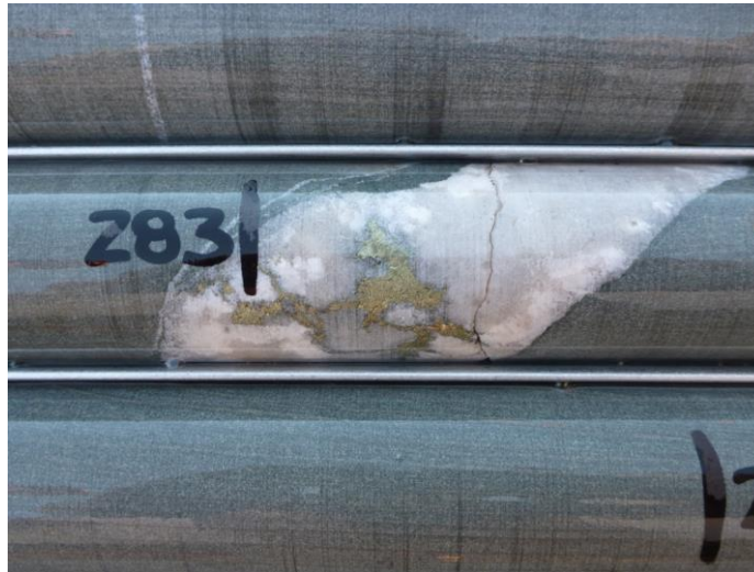
Figure 2 – Chalcopyrite in quartz vein within grey metasediment

The Oodnadatta Project tenements lie along and adjacent to the Peake – Denison Ranges which include the Peake Metamorphics and the Wirriecurrie Granite.