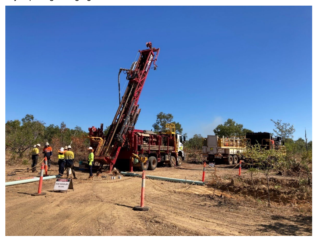
Figure 1: RC drilling underway at Nabarlek Uranium Project (NT)

Against the backdrop of a strong resurgence in the uranium spot price – with prices recently trading above US55/lb U _3 O _8 – DevEx is one of a select few ASX-listed companies which is fully permitted and actively exploring for high-grade uranium in Australia.